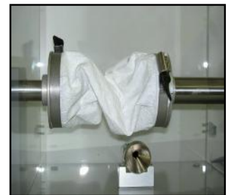
* EXAMPLE * Sample being tested